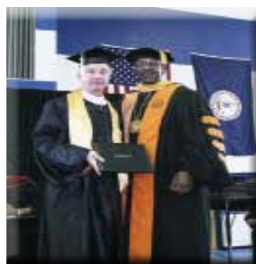
Graduation pictures