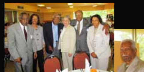
Just a few of our miracles...

SAINT PAUL'S COLLEGE 115 COLLEGE DRIVE LAWRENCEVILLE, VIRGINIA 23868 (434) 848-3111